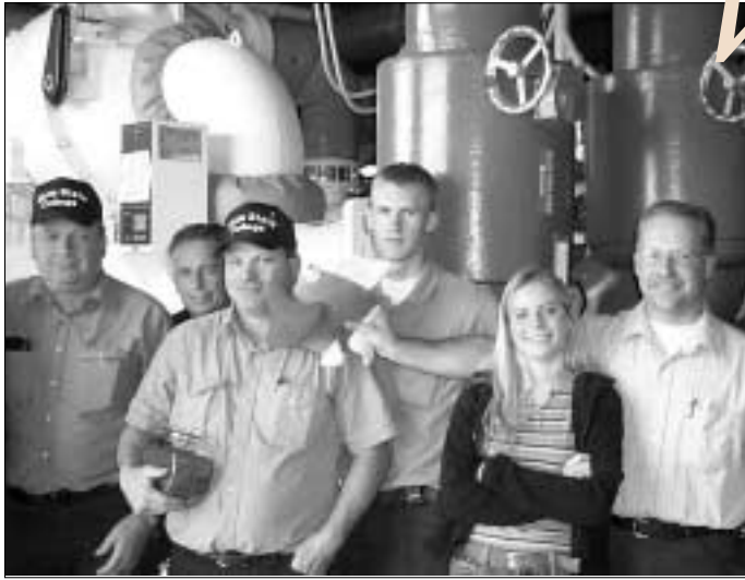
Dixie's Heating Plant received the first-ever departmental "Fish Award" (Lippemomba) along with a fishbowl full of gumi worms.